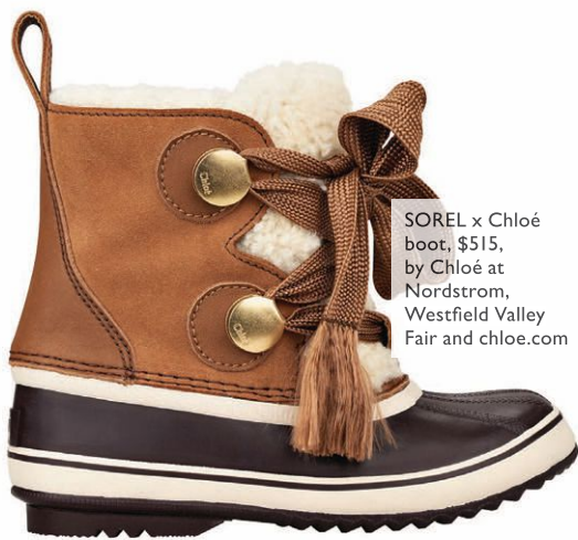
SOREL x Chloé boot, $515, by Chloé at Nordstrom, Westfield Valley Fair and chloe.com