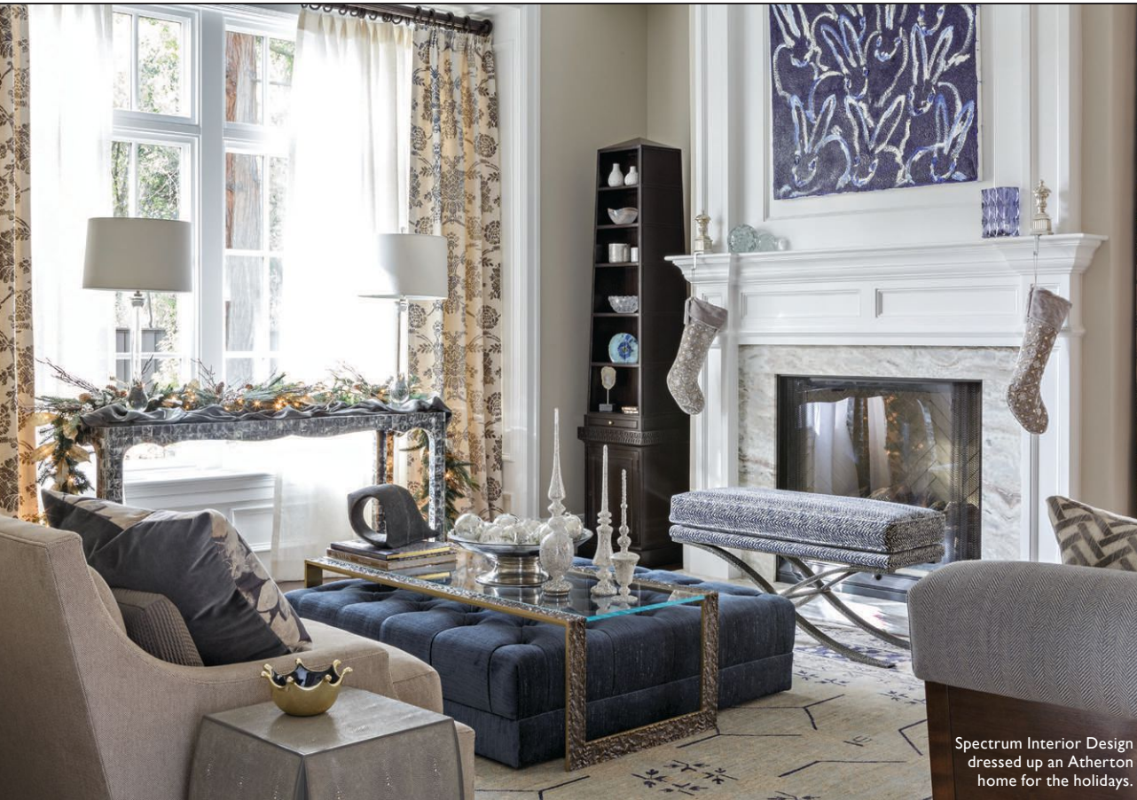
Spectrum Interior Design dressed up an Atherton home for the holidays.